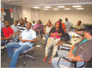
25 QC workshop participants from 14 countries participated in a brainstorm session to identify top-priority topics for SLMTA 2.0