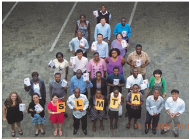
Group Photo QC Workshop, November 4-12, 2013 Roche Scientific Campus, Johannesburg, South Africa